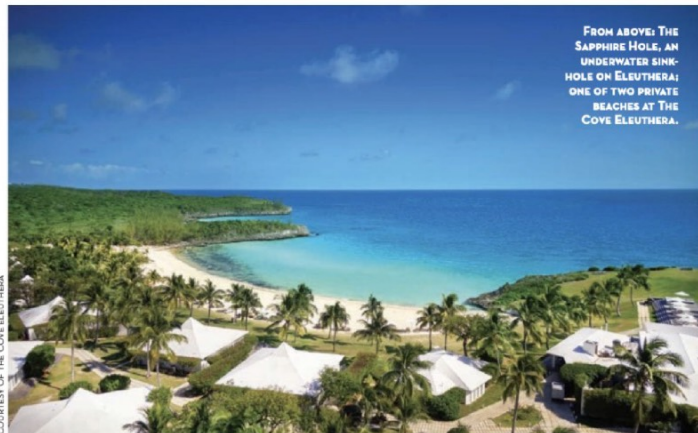
FROM ABOVE: THE SAPPHIRE HOLE, AN UNDERWATER SINK-HOLE ON ELEUTHERA; ONE OF TWO PRIVATE BEACHES AT THE COVE ELEUTHERA.

Upon arrival, the resort's personable staff greets you for check-in. Expect to be called by name and whisked away to one of the property's 29 guest accommodations, which include one-, two-, and three-bedroom suites, cottages, and beachfront villas. All guest rooms are luxe and well-appointed,