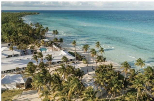
CLOCKWISE FROM ABOVE: CAERULA MAR CLUB SITS ON A 10-ACRE WATERFRONT SITE; THE POOL INVITES LOUNGING OR CASUAL DINING AT THE ADJACENT DRIFFS BEACH BAR.