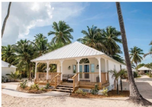
CAERULA MAR CLUB