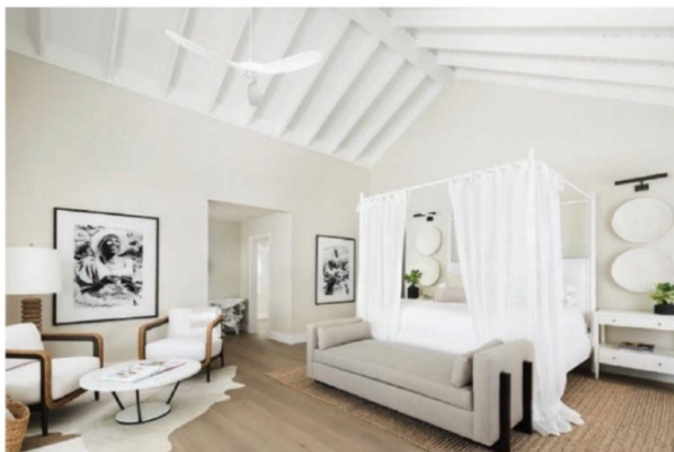
CAERULA MAR CLUB